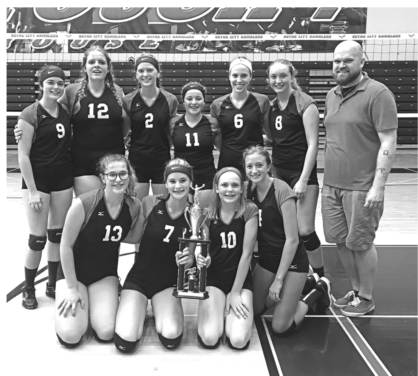
The Boyne City JV were victorious during the Boyne Invitational Tournament, defeating Kingsley in the finals.